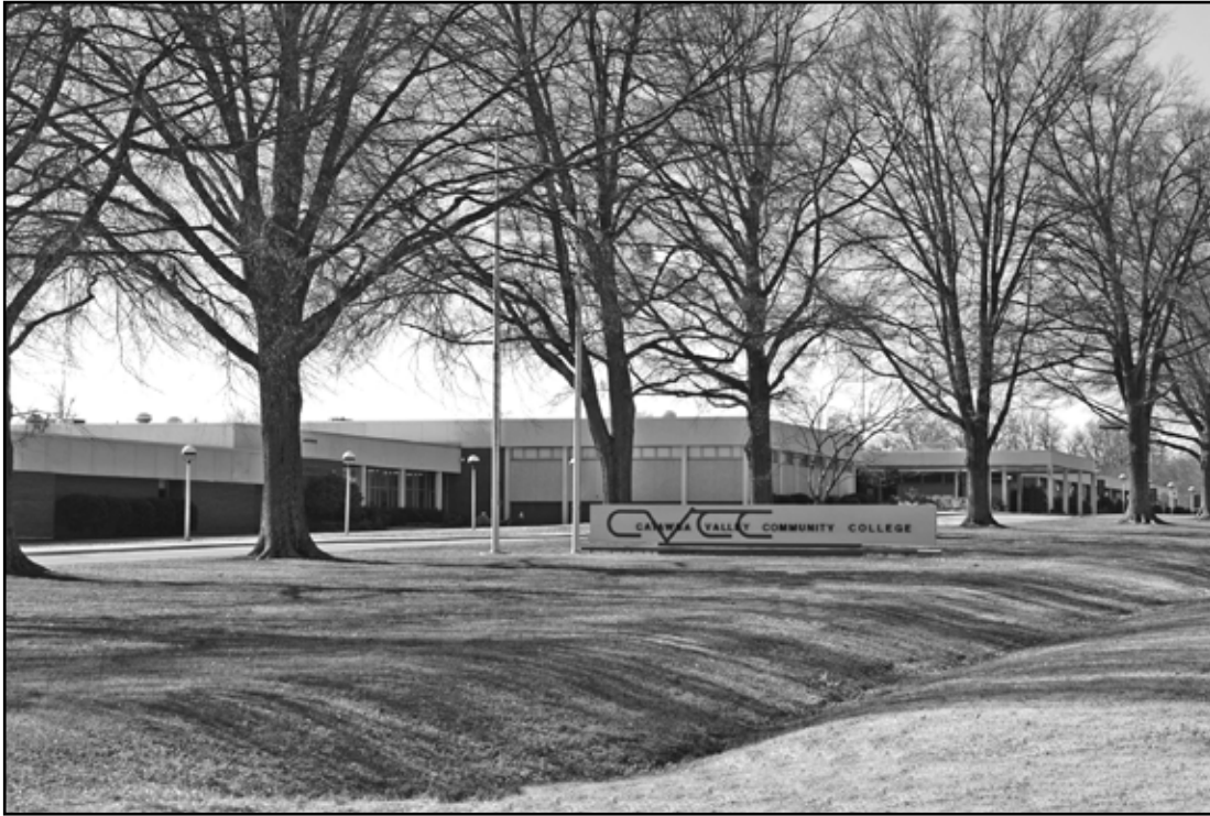
CVCC Main Campus