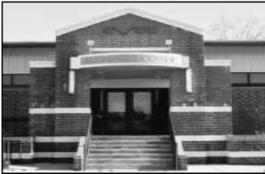
CVCC Alexander Center for Education