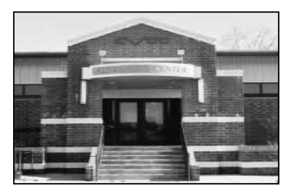
CVCC Alexander Center for Education