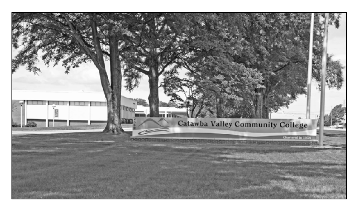
CVCC Main Campus