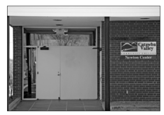
CVCC Newton Center